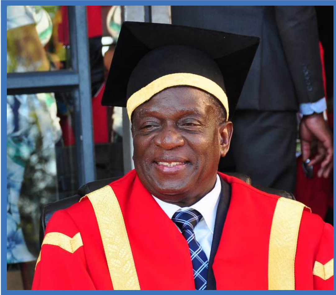
HIS EXCELLENCY AND CHANCELLOR, DR CDE EMMERSON DAMBUDZO MNANGAGWA

LLB (University of London), Hon. PhD (NUST), Hon. LLD (MSU), Hon. DPIR (GZU), Hon. LLD (UZ), Hon. D. Eng. (CUT), Hon PhD (NDU), LLD, LLB, LPI (University of Zambia), Hon PhD (BUSE).