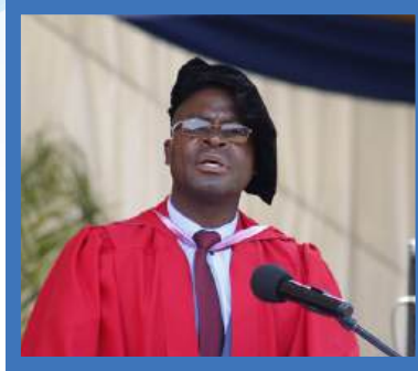
Prof dr Amon Murwira Minister of Higher and Tertiary Education, Innovation, Science and Technology Development.